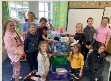
Children from Dunbog Primary School with APRS's mock deposit return RVM.

Through the Fife STEM Connect-ability Festival in 2022, schools across rural communities in Fife invited APRS to deliver their Deposit Return presentation, with the children sharing excitement about DRS coming to Scotland through posters, see right.