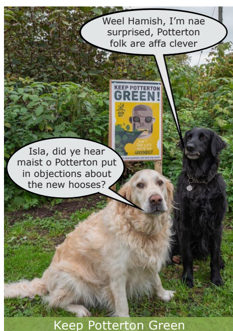
Keep Potterton Green